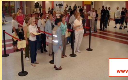
Volunteer "patients" wait in line at smallpox clinic exercise (June 2004).

In the event of an epidemic or bioterrorism attack, local public health officials may need to treat a large number of people in a short period of time (many thousands per day). To prepare for this event, health officials around the country have created plans for mass dispensing and vaccination clinics, also known as points of dispensing (PODs). These clinics would be set up in schools, churches, and community centers.